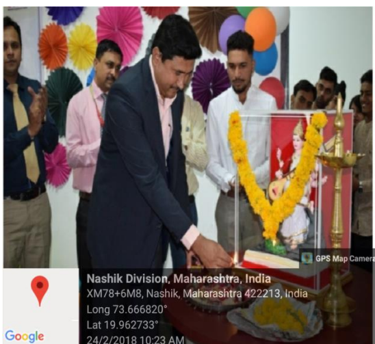
Lamp lighting by Chief Guest