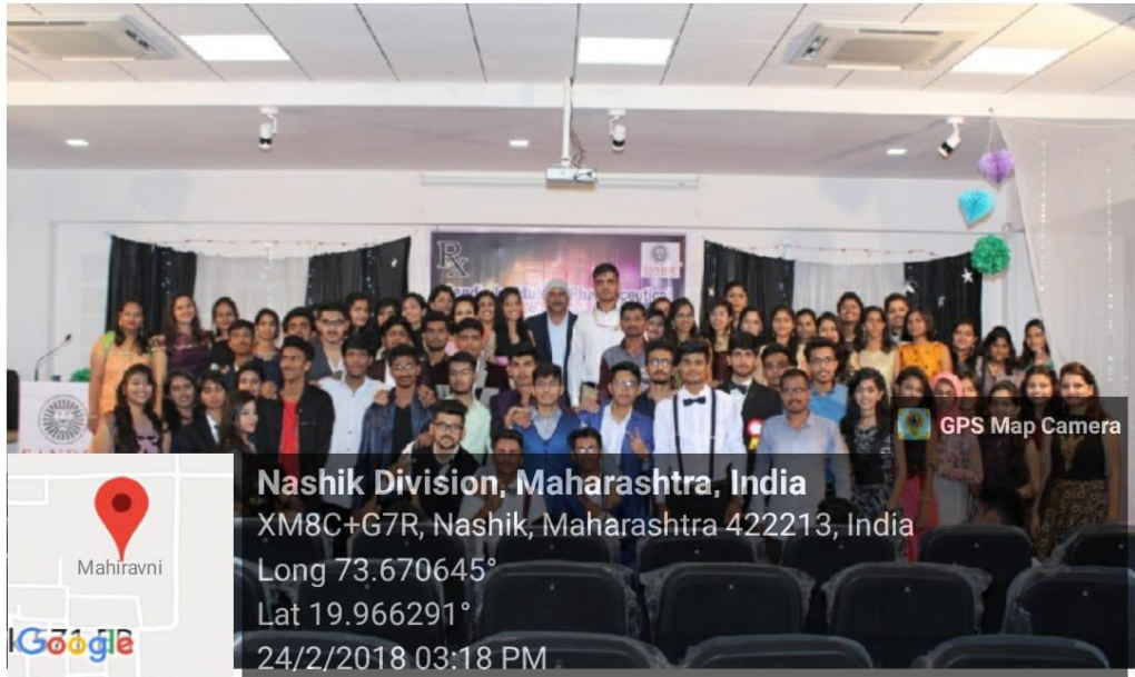
Group photo of Chief Guest, alumni and staff