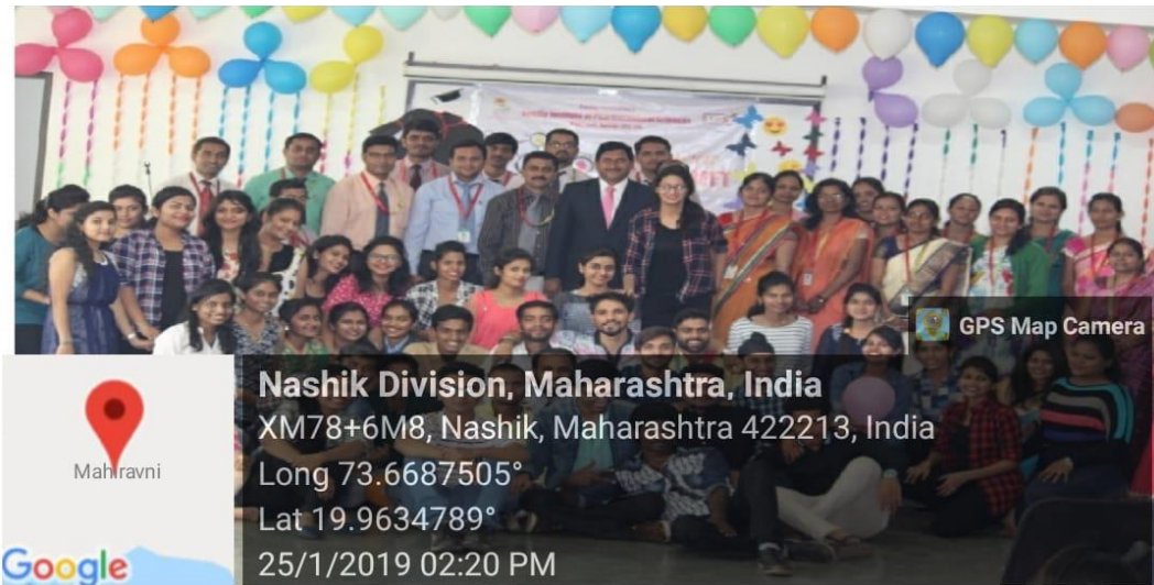
Group photo of Chief Guest, alumni and staff