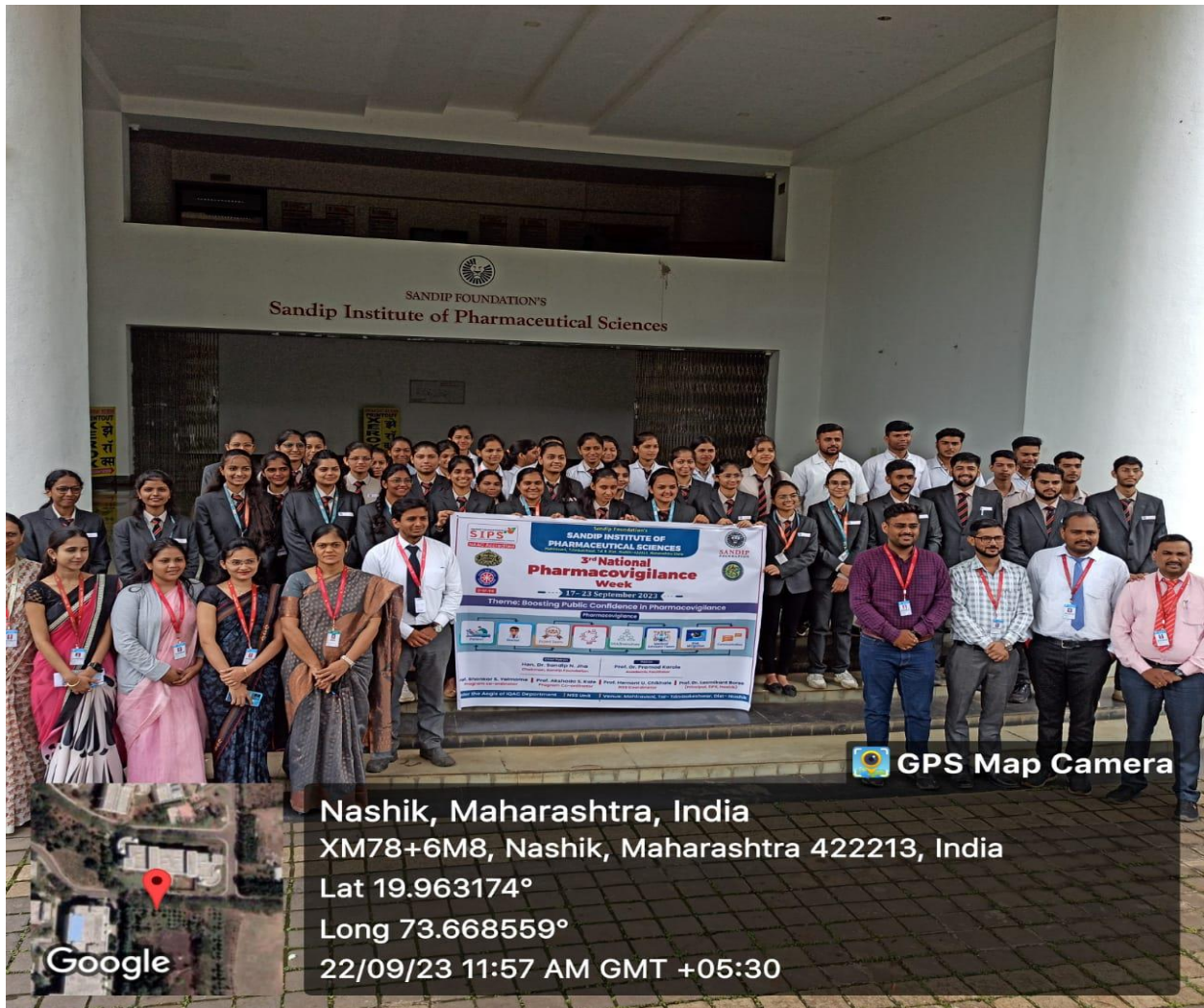
Celebration of 3 rd National Pharmacovigilance week at SIPS