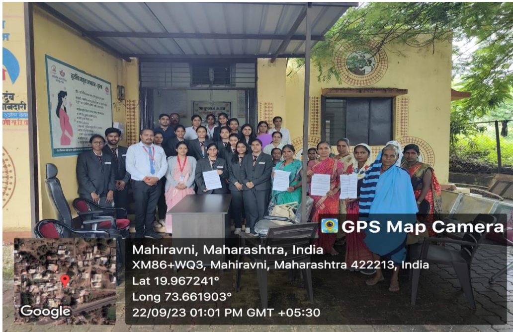
Distribution of ADR reporting pamphlets to public at Mahiravani, Nashik