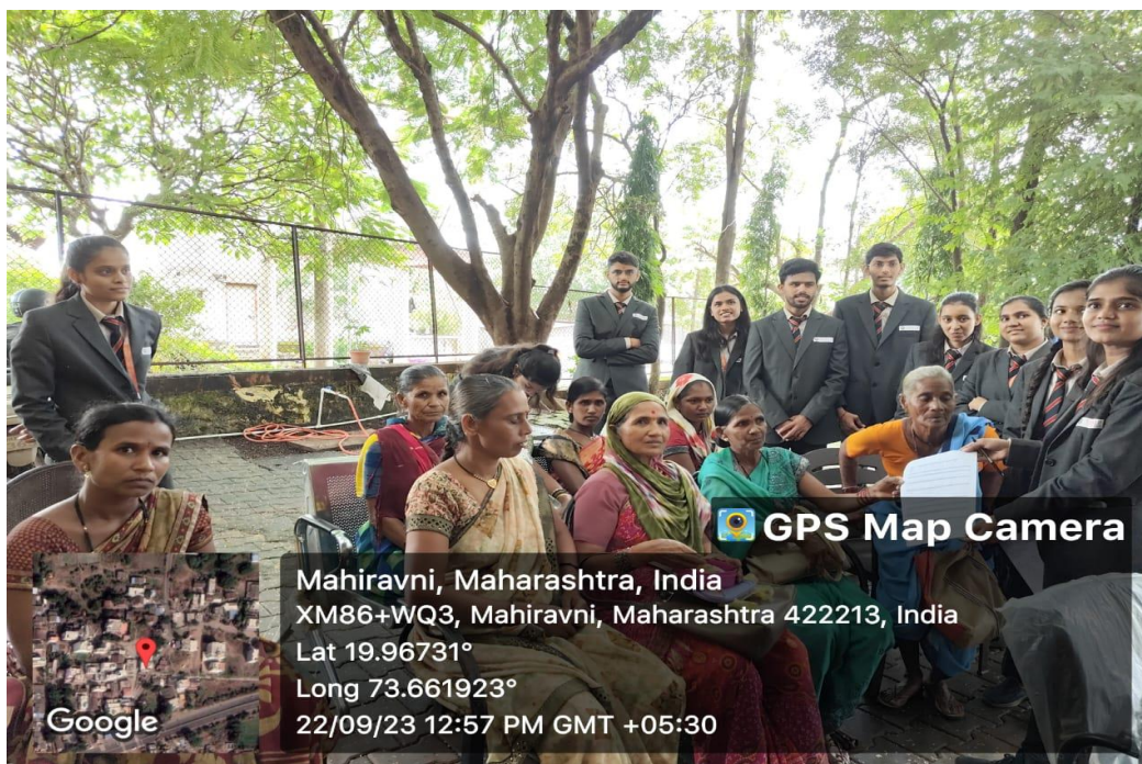
Students giving information to public