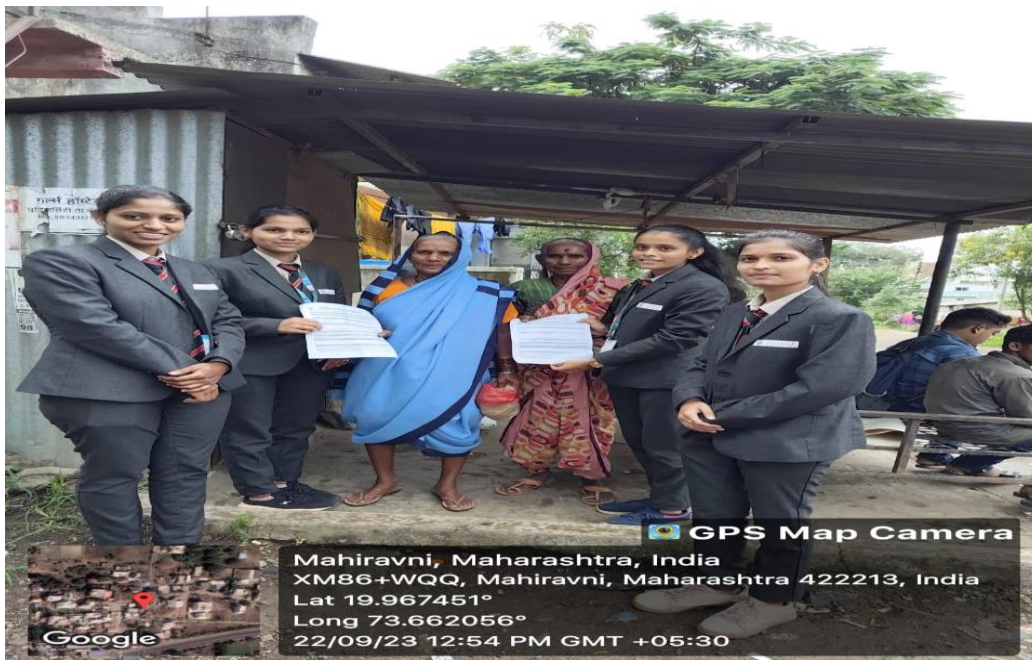
Students Distributing pamphlets to public