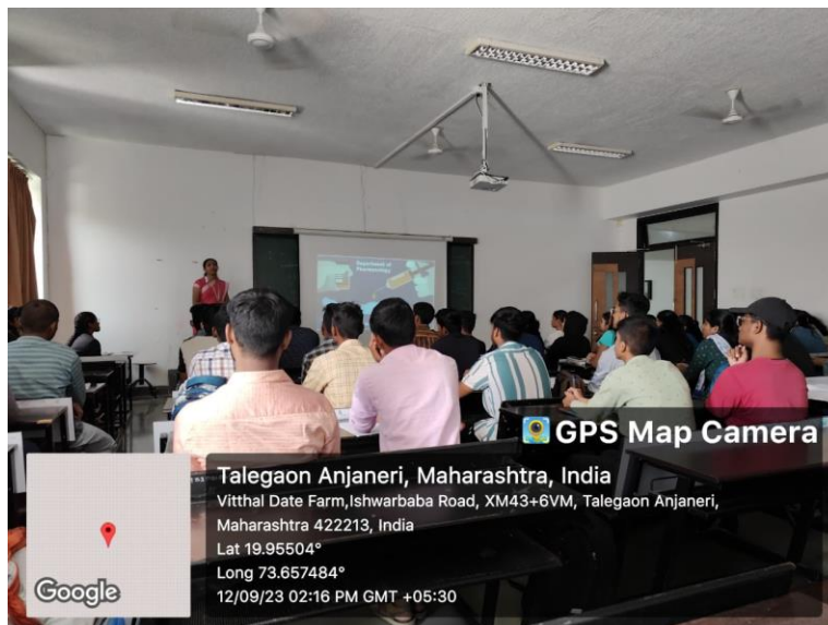
Department wise presentation by HOD