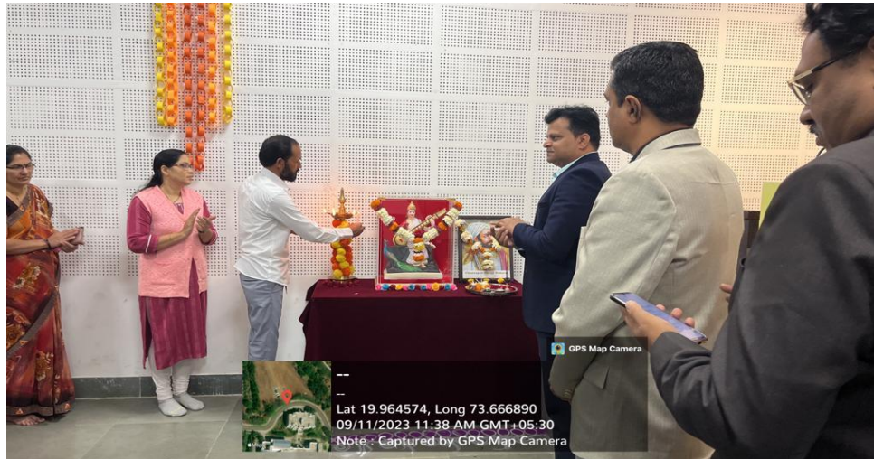
Lamp Lighting by parents

Affiliated to Savitribai Phule Pune University, Approved By PCI, New Delhi, NAAC Accredited