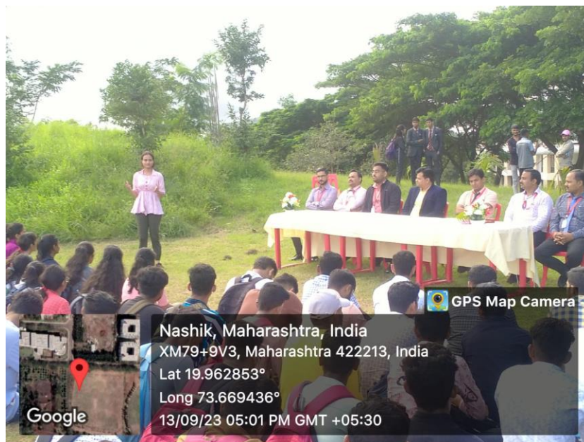
Feedback given by students on Induction program