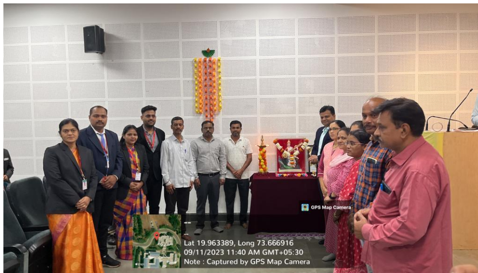
Staff members SIPS and Parents