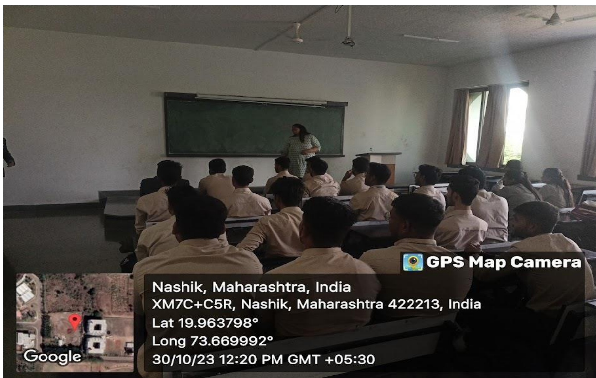
Training session on communication (By Ms Ritika Saxena)