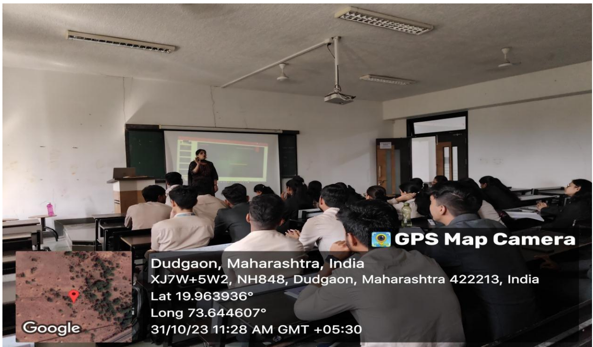
Training session on "Active listening"