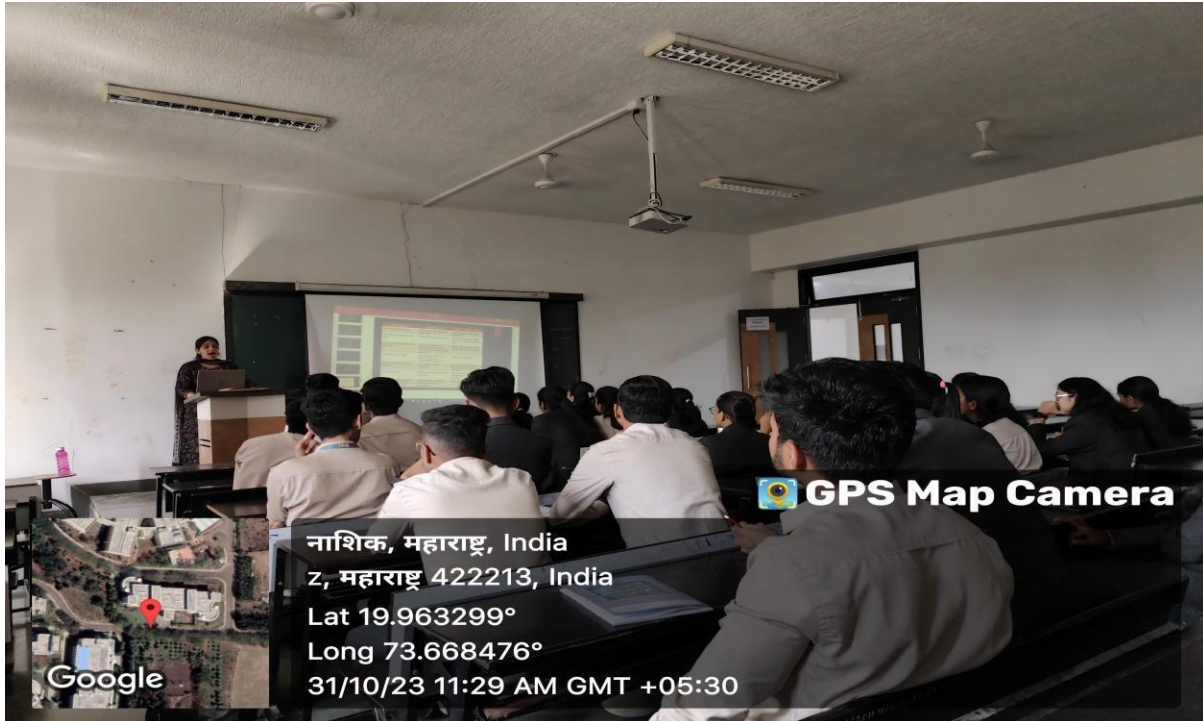
Training session on "Cooperation and Coordination"