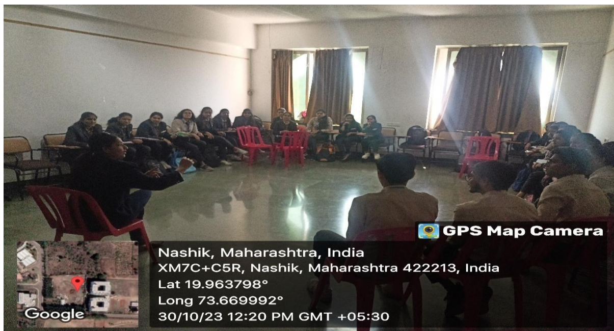
Group discussion session on "Business vs. Job"