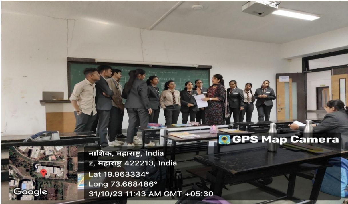
Soft skills activity session