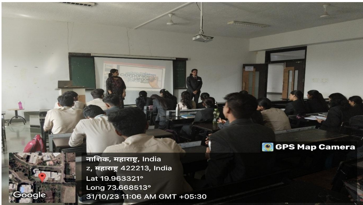
Interactive session on "Corporate Jargon"