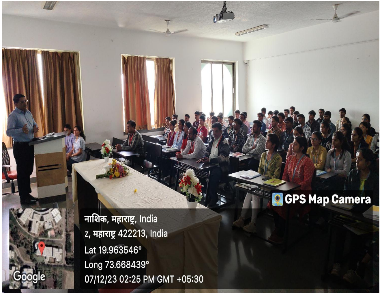
Talk on “self-awareness and attitude”