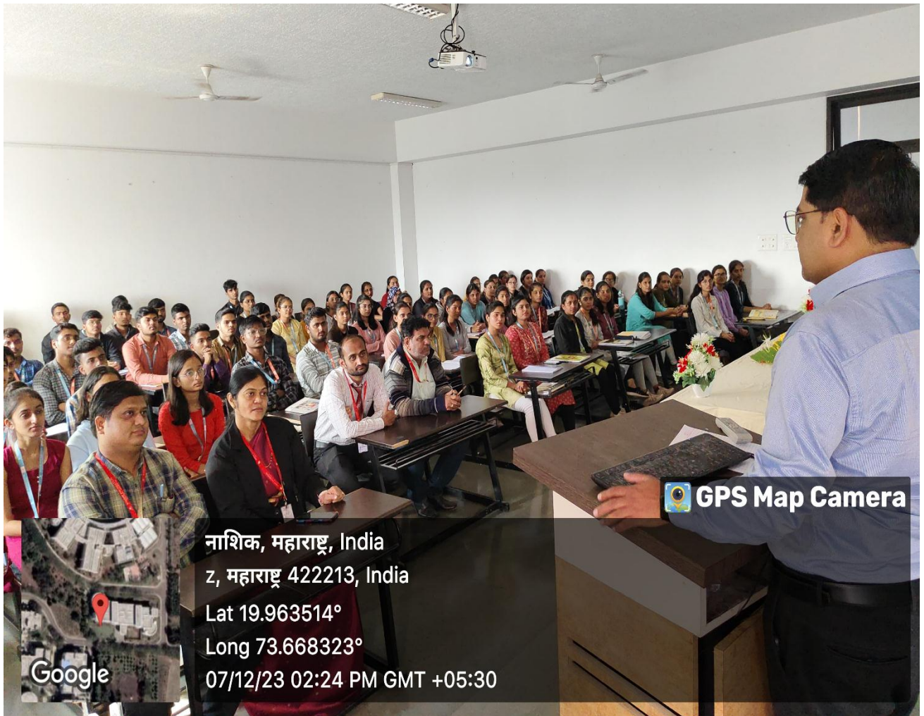
Interactive session on “Career planning action plan”