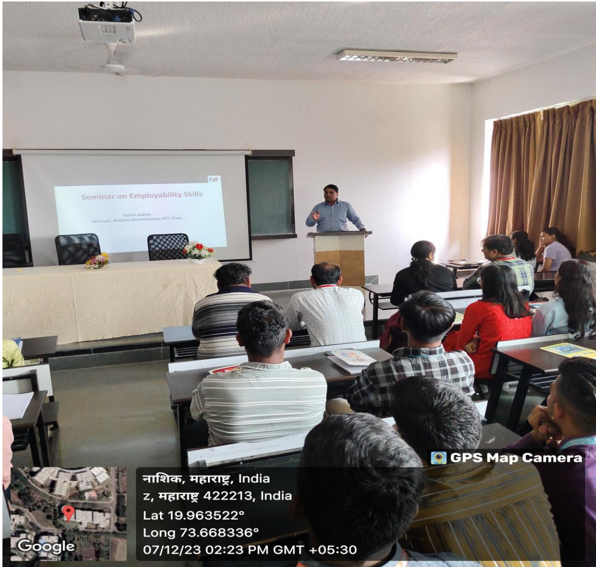
Interactive discussion on “Adaptability and Flexibility”