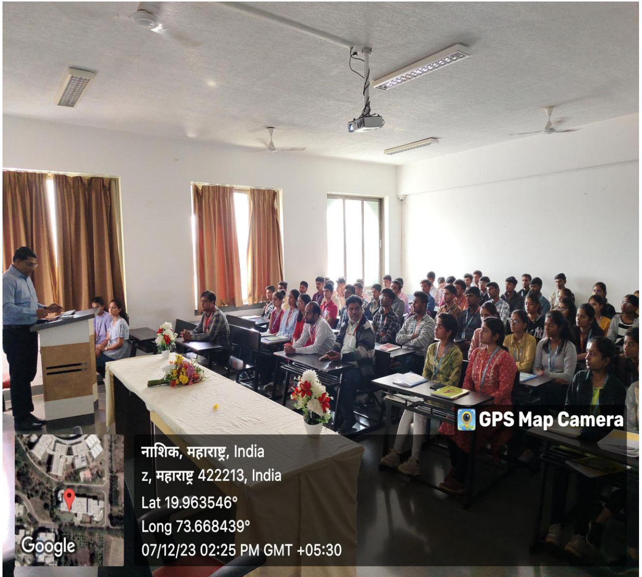
Talk on “choices and challenges in professional life”