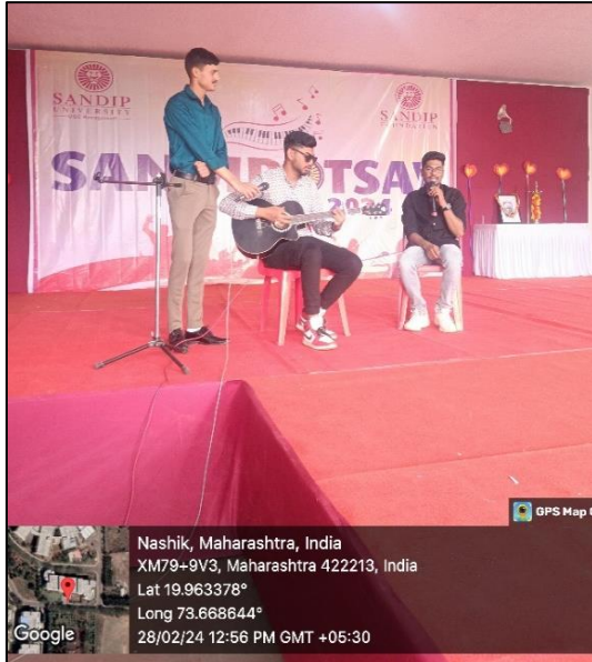
Nashik, Maharashtra, India XM79+9V3, Maharashtra 422213, India Lat 19.963378° Long 73.668644° 28/02/24 12:56 PM GMT +05:30

Affiliated to Savitribai Phule Pune University, MSBTE, Approved by PCI, New Delhi, NAAC Accredited