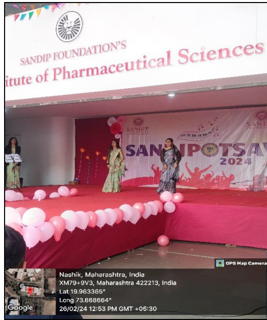
Nashik, Maharashtra, India XM79+9V3, Maharashtra 422213, India Lat 19.963365° Long 73.668664° 26/02/24 12:53 PM GMT +05:30