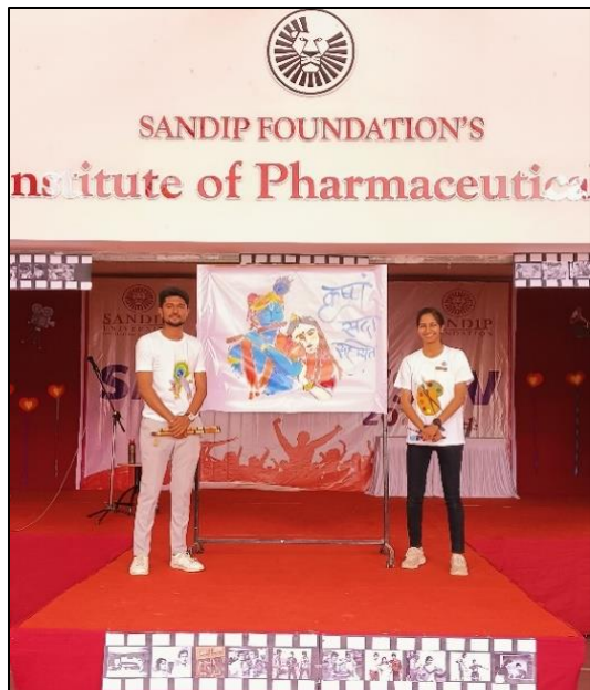
Nashik, Maharashtra, India XM79+9V3, Maharashtra 422213, India Lat 19.963365° Long 73.668664° 26/02/24 12:53 PM GMT +05:30