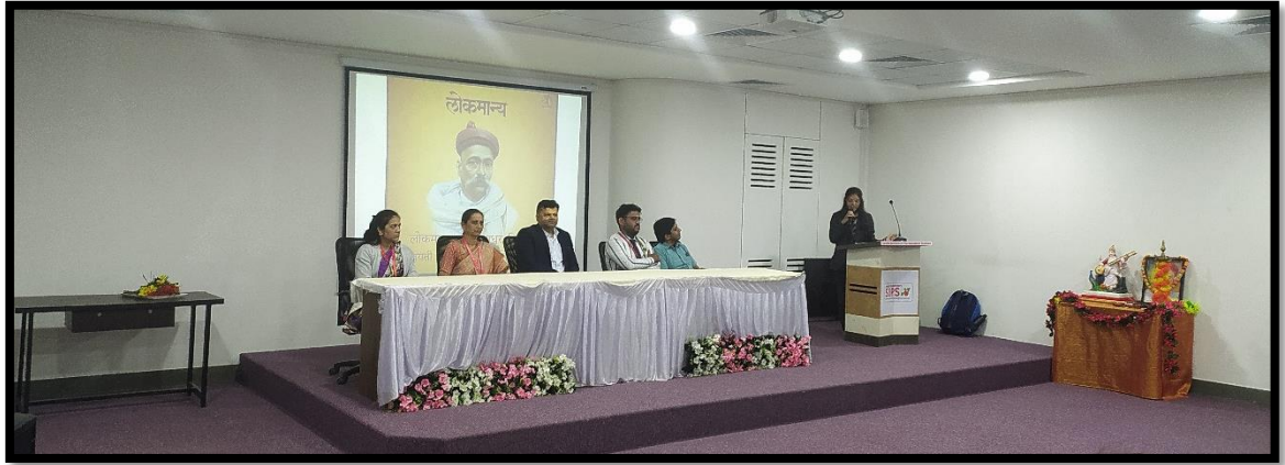
The event featured speeches by students