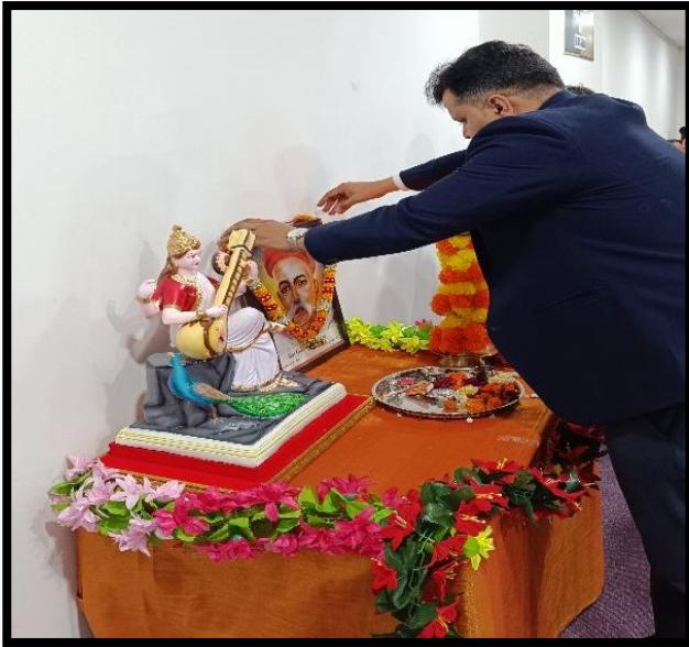
Principal Sir garlands the portrait of Lokmanya Bal Gangadhar Tilak