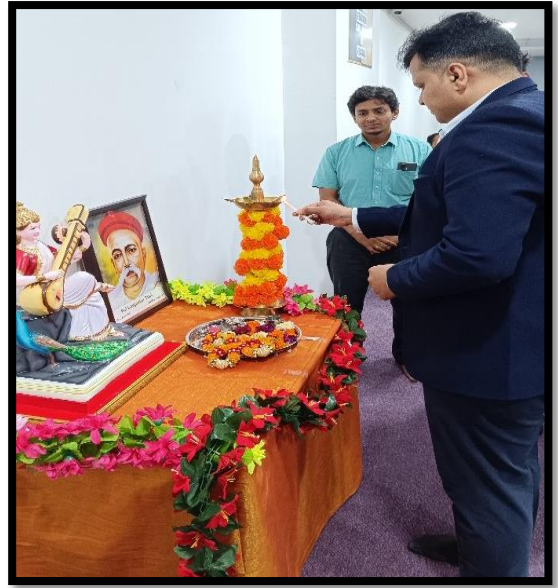
Principal Sir lights the ceremonial lamp during the Lokmanya Bal Gangadhar Tilak Jayanti celebration