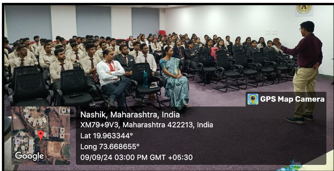
Students attendance for Guest Lecture