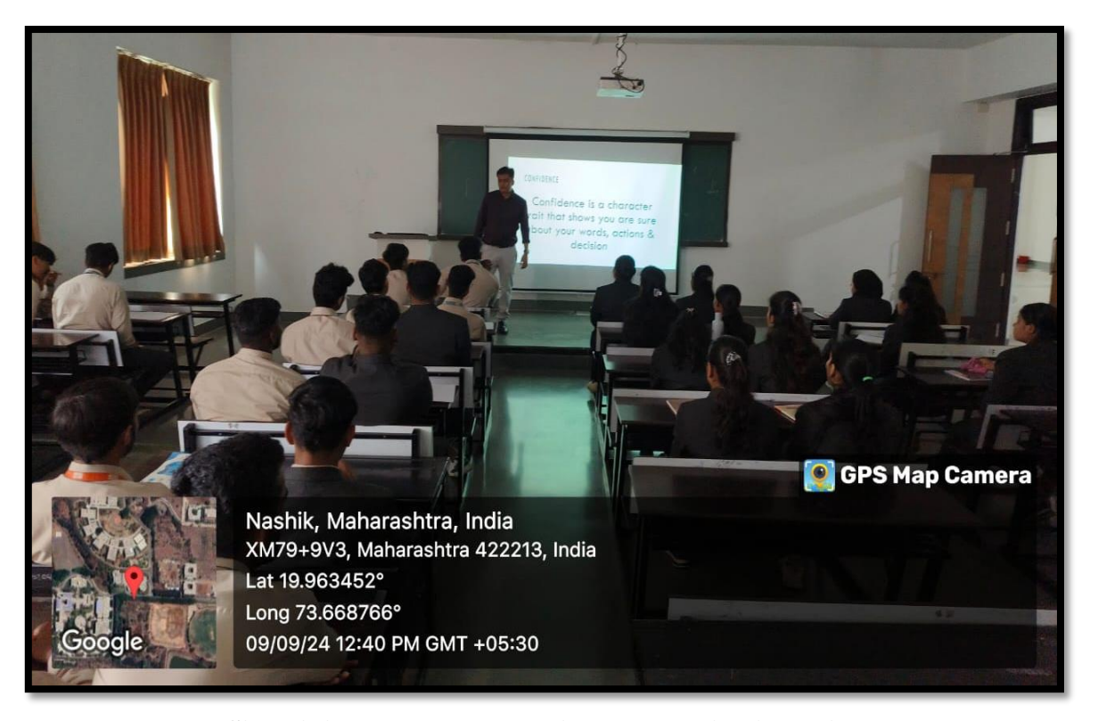
Sir guiding students regarding communication skills