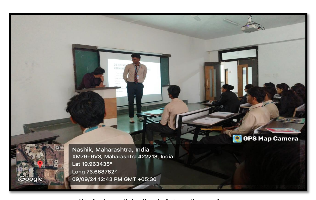
Students participating in interactive session