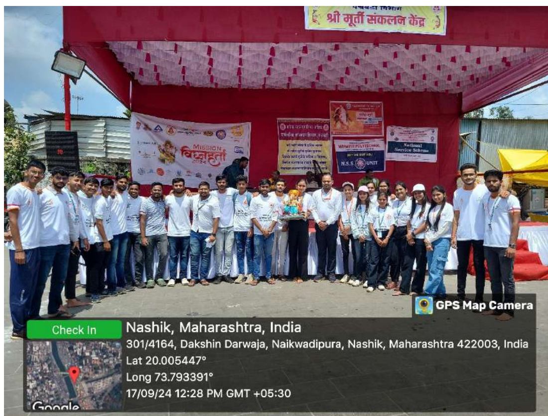
Volunteers Participated For Ganesh Idol Collection