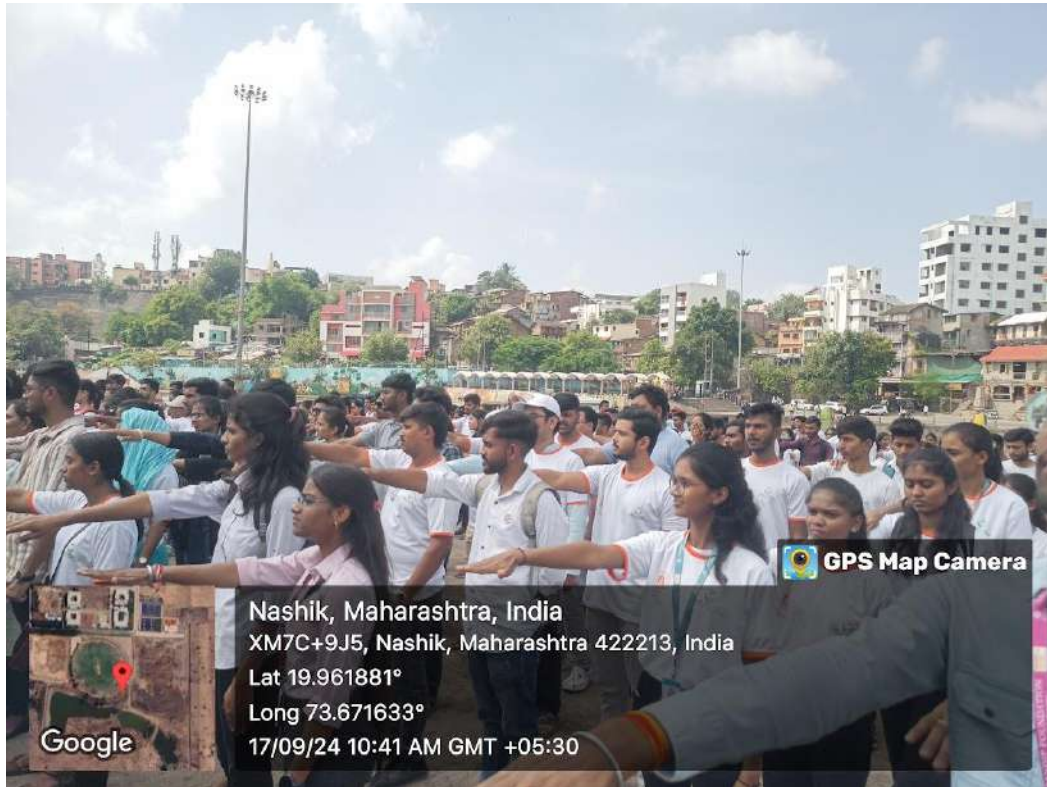
Volunteers has Taken Cleanliness Oath