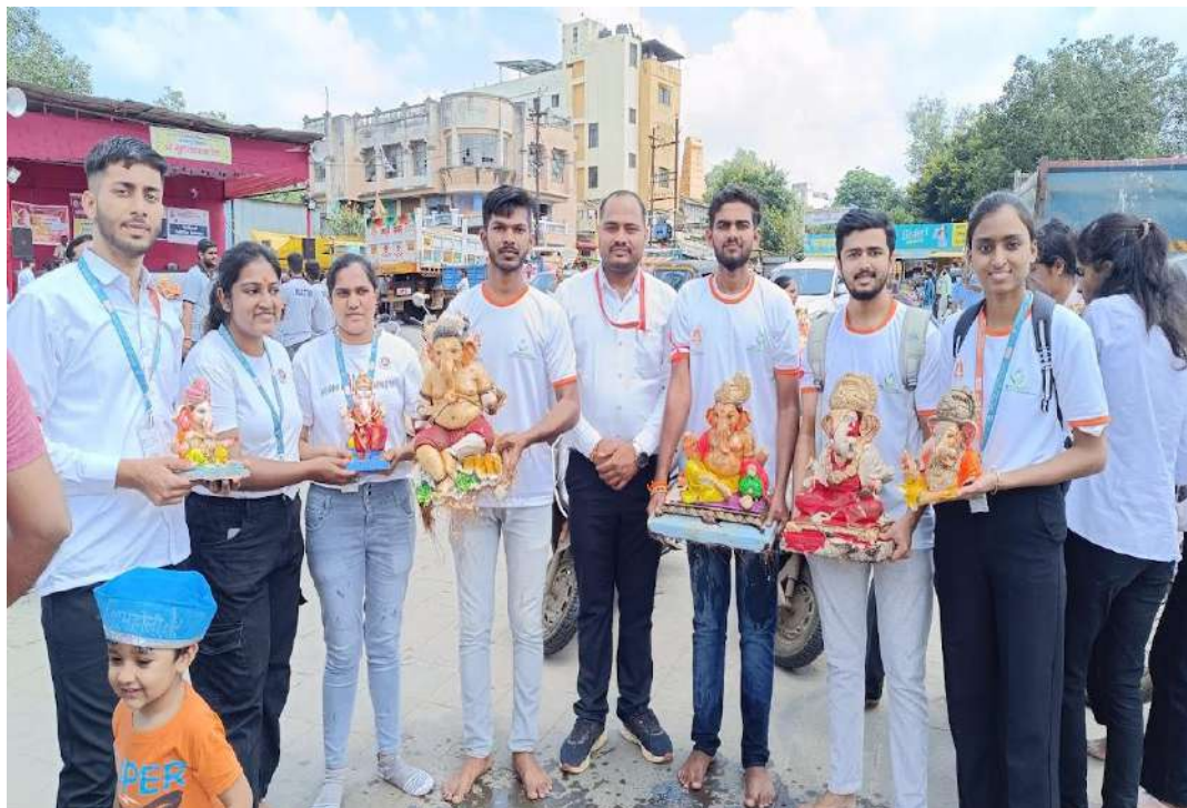
Volunteers Collected Ganesh Idol