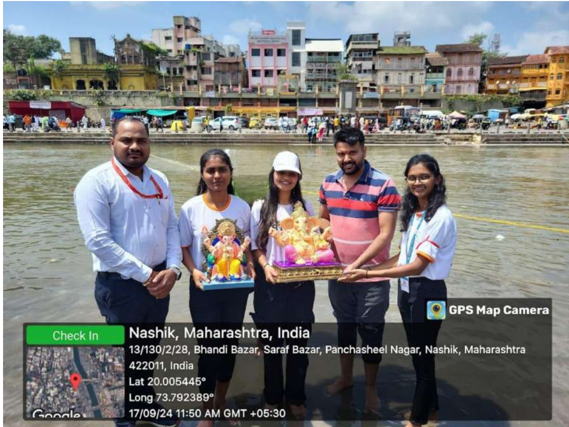
Citizens donated Ganesh Idols