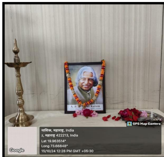
Principal Sir lights the ceremonial lamp during the Dr. A P J Abdul Kalam birth anniversary celebration