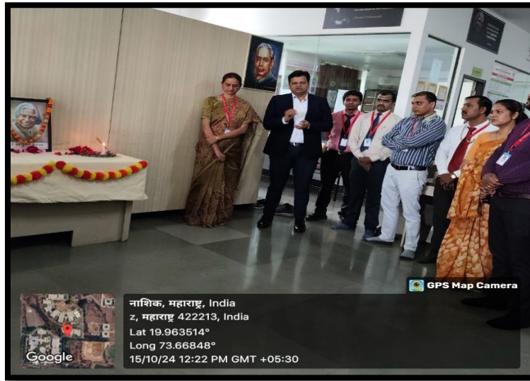
The event featured speech by Principal Sir