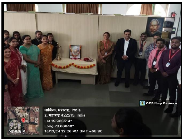
Faculty members and students gather for Dr. A P J Abdul Kalam birth anniversary celebration