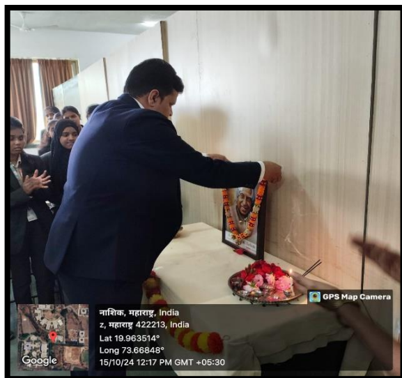
Principal Sir garlands the portrait of Dr. A P J Abdul Kalam