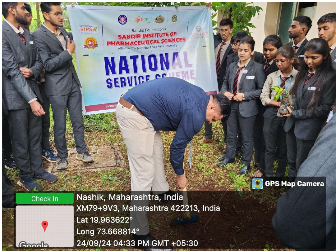
Tree Plantation by NSS Unit