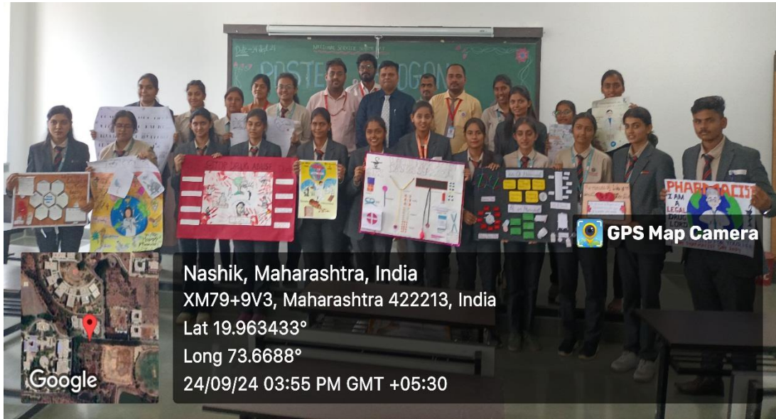
Students Participated in Poster & Slogan Competition