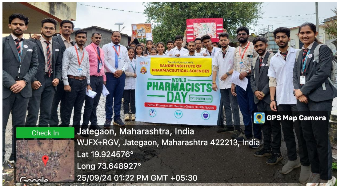
Students Participated in health Awareness Rally