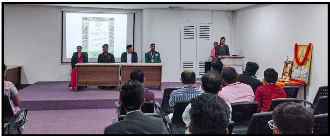
Speech given by Student Addressing the "Role of the Constitution in Shaping Modern India"