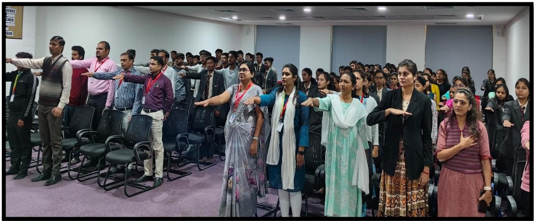
A ceremonial reading of the Preamble of the Indian Constitution with active participation from the attendees