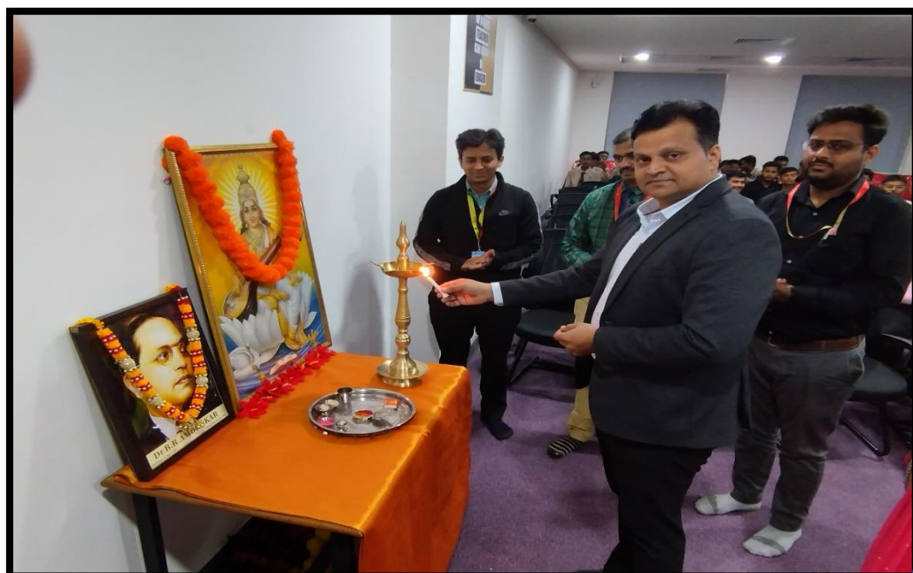
Principal Sir lights the ceremonial lamp during the National Constitution Day Celebration