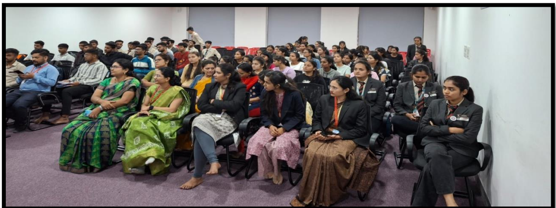
Faculty members and students gathered for National Education Day Celebration