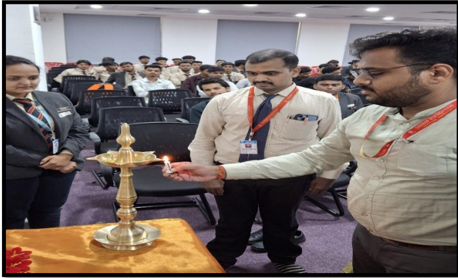
HOD Sir lights the ceremonial lamp during the National Education Day Celebration