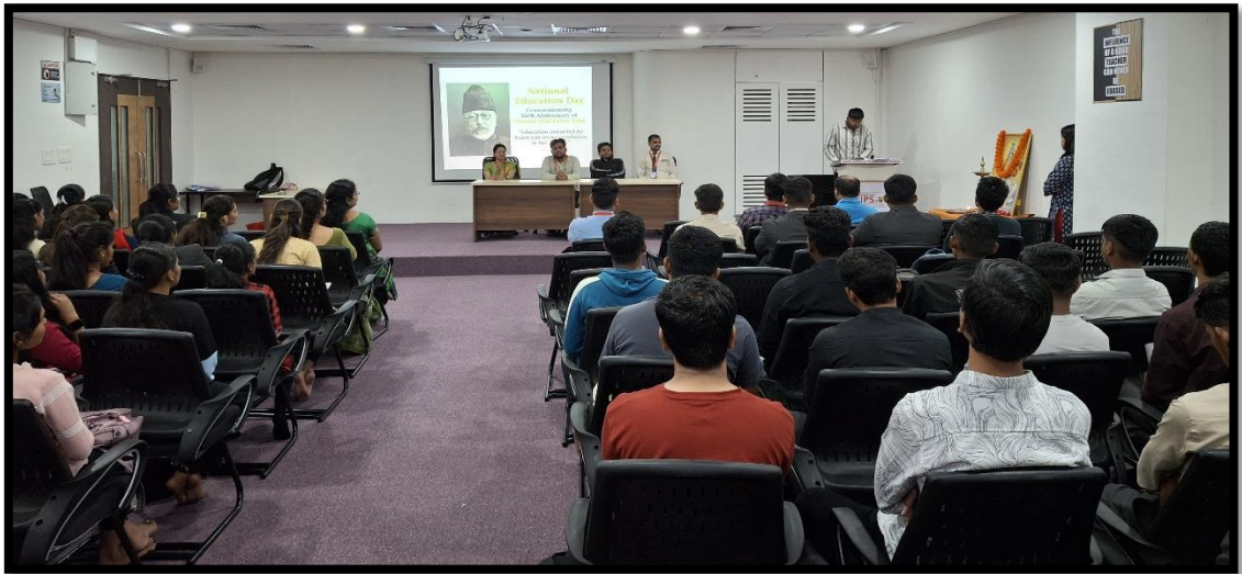
Speech given by Student Addressing theme of National Education Day