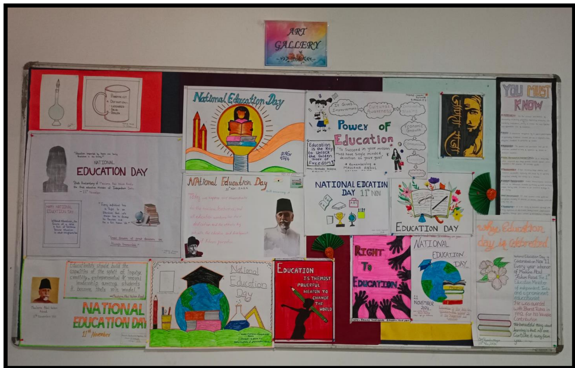
Students from different streams prepared posters on National Education Day