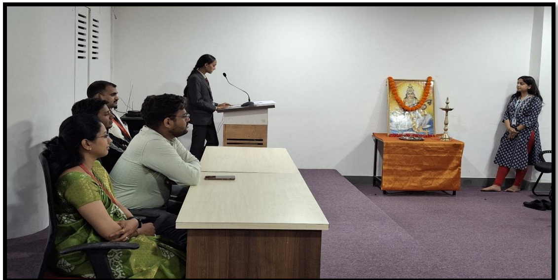
Speech given by Student on Importance of National Education day