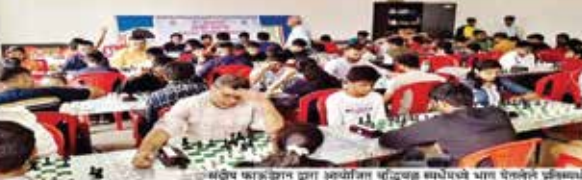
संदीप फाउंडेशन द्वारा आयोजित बुद्धिबळ स्पर्धेमध्ये भाग घेतलेले स्पर्धी.

फाउंडेशनच्या फार्मसी विभागातून सहभाग घेतल्यामुळे स्पर्धा उत्साहाने संपन्न पार पाडी. आयोजित केलेल्या स्पर्धा यामध्ये स्पर्धी विविध स्पर्धा यामध्ये सहभाग घेतले. आयोजित केलेल्या स्पर्धा यामध्ये स्पर्धी विविध स्पर्धा यामध्ये सहभाग घेतले.