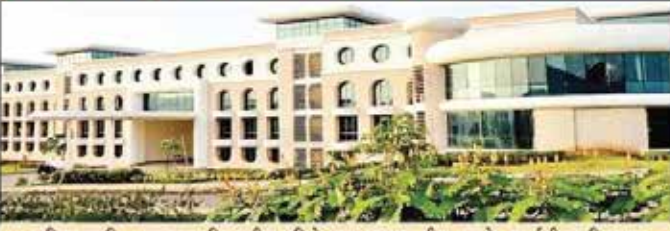
नाशिक आणि अहमदनगर जिल्हातील पहिले, उत्तर महाराष्ट्रातील एकमेव फार्मसी महाविद्यालय

नाशिक, स्वयंपूर्वीचाई घुले पुणे विद्यापीठ संलग्न संदीप फार्मसी महाविद्यालय संदीप इन्स्टिट्यूट ऑफ फार्मास्युटिकल सायन्सेस (SIPS) ने राष्ट्रीय मान्यतांकन आणि मान्यतांकन परिषदेने (NAAC) दुसऱ्यां फेरीत A+ ग्रेदी देऊन गौरविले आहे. महाविद्यालयास एकूण 4 सीविएएफ्सी 3.37 गुण प्राप्त झाले आहे. SIPS नाशिक आणि अहमदनगर जिल्हातील पहिले प्रत्येकी महाविद्यालय आहे ज्याने असे प्रमाणित मान्यतांकन प्राप्त केले आहे. या मान्यतांकनामुळे संस्थेने