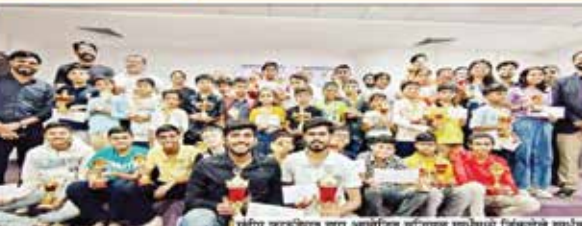
संदीप फाउंडेशन द्वारा आयोजित बुद्धिबळ स्पर्धेमध्ये विजयलेखी स्पर्धी.

नाशिक. नाशिक येथील येथील संदीप फाउंडेशन आयोजित बुद्धिबळ स्पर्धा उत्साहाने संपन्न पार पाडी. ही स्पर्धा विद्यार्थ्यांमध्ये उत्साह संदीप फाउंडेशनच्या फार्मसी विद्यार्थ्यांमध्ये आयोजित करण्यात आली होती. विजेत्यांना एकूण 30 हजार रुपयांची पैसे वार्षिक पुरस्कार देऊन 42 आठवड्यांचा प्रवास देऊन निवृत्तिलास आहे. ही स्पर्धा 8 फेब्रुवारीचे निघतात आली. अखेर महाराष्ट्रमधून पुणे, कोलकाता, पुणे, जालिमगर, बीरगनूर, मुंबई, कोलकाता येथून सहूद 202 बुद्धिबळ स्पर्धेमध्ये 82 स्पर्धी सहभाग घेतले होते.