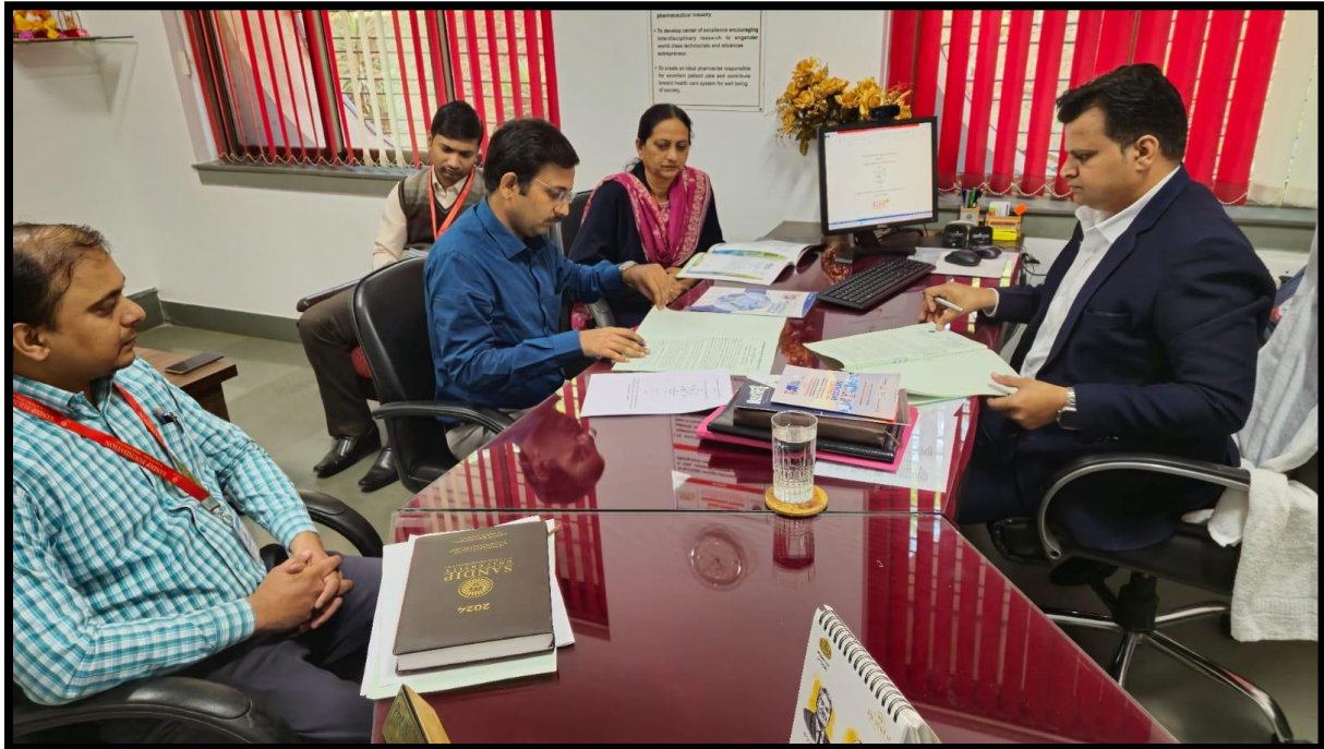
"Reviewing the Vision: Leaders from Operant Pharmacy Federation and Sandip Institute of Pharmaceutical Sciences finalize the details of the MoU."