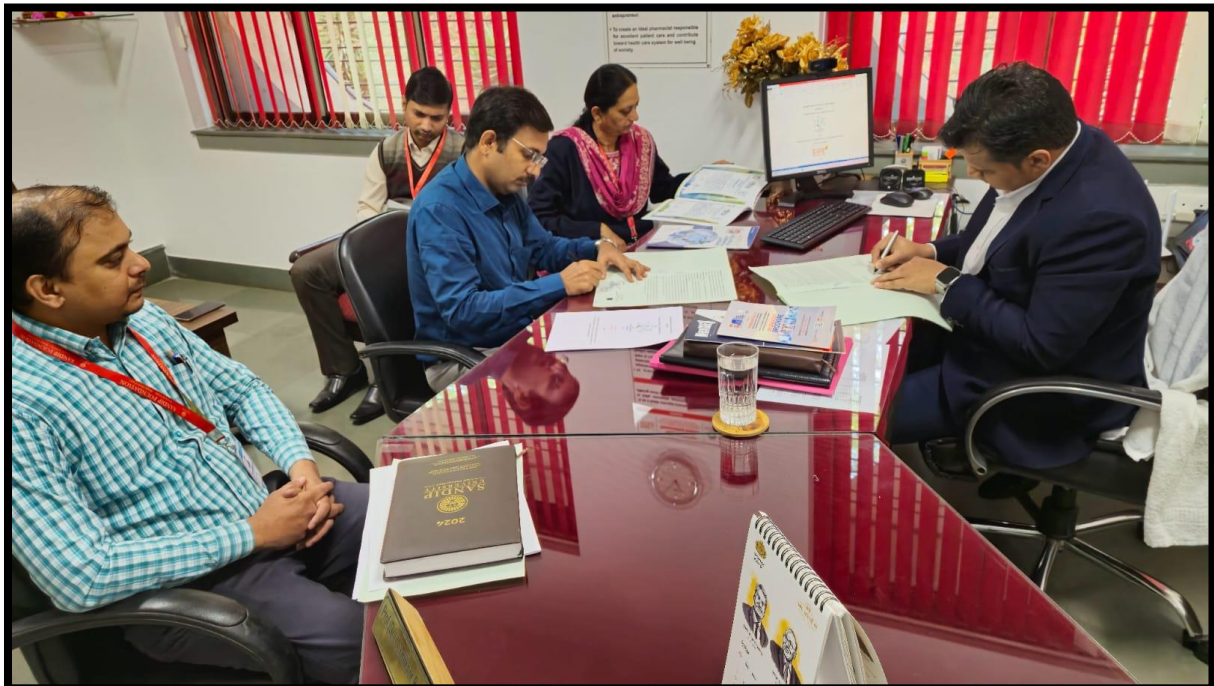
"Sealing the Partnership: A moment of collaboration as the MoU is officially signed."