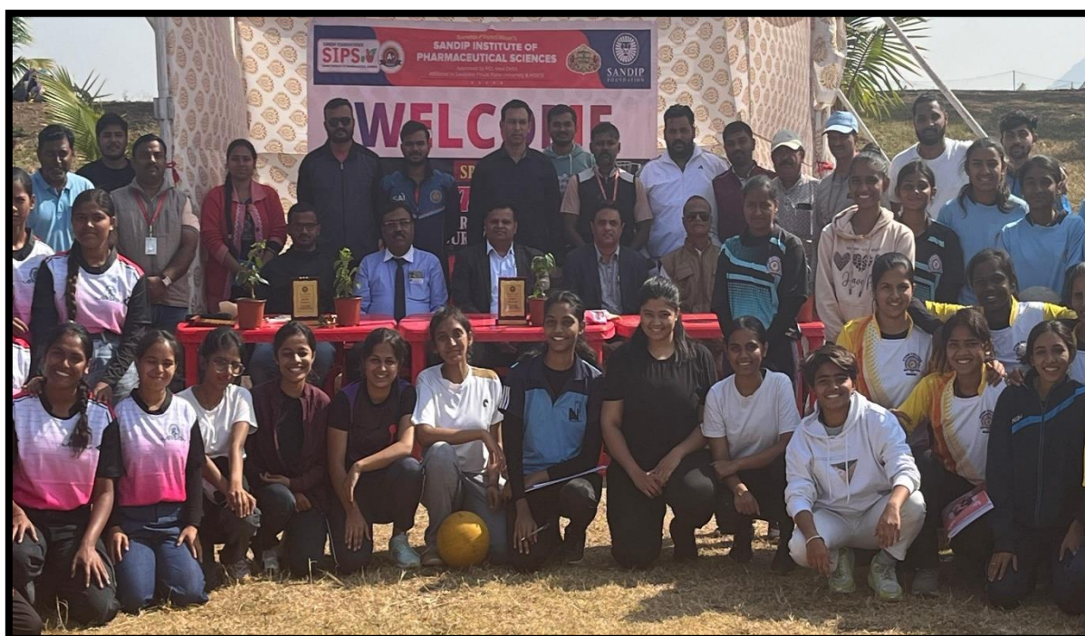
Participants of event