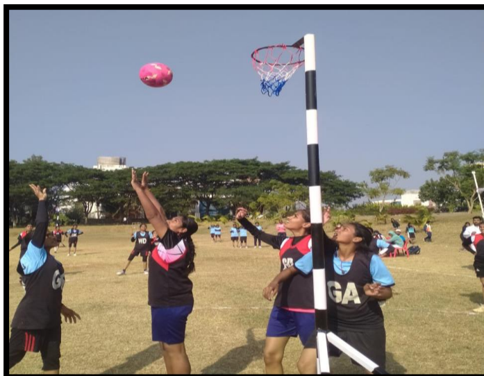
College students participating in a netball match