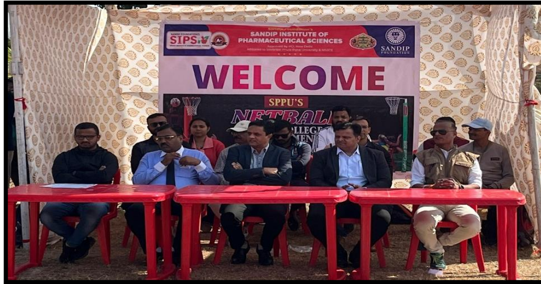
Dignitaries for the event